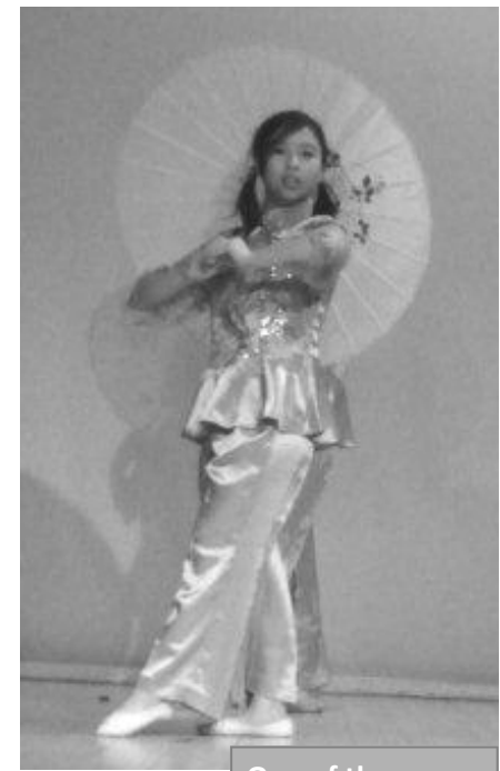
One of the young Chinese dancers

As for the Indian musicians and the graceful gyrating Indian dancers, one can only admire their artistic excellence and professionalism. This was an entertainment that would, in other situations, be too costly for an event run by a poor charity like ours. We