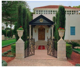
Shrine of Bahá'u'lláh near St. Jean d'Acre

The Surrey Bahá'í community, along with Bahá'ís all over the world, are celebrating the bicentenary of the Birth of Bahá'u'lláh, the Founder of their Faith. Each Messenger brings social teachings designed for that particular age and the coming of Bahá'u'lláh was the beginning of a new age in the history of mankind. Much information about His life and teachings can be found at www.bahauallah.org & www.bahauallah.com .