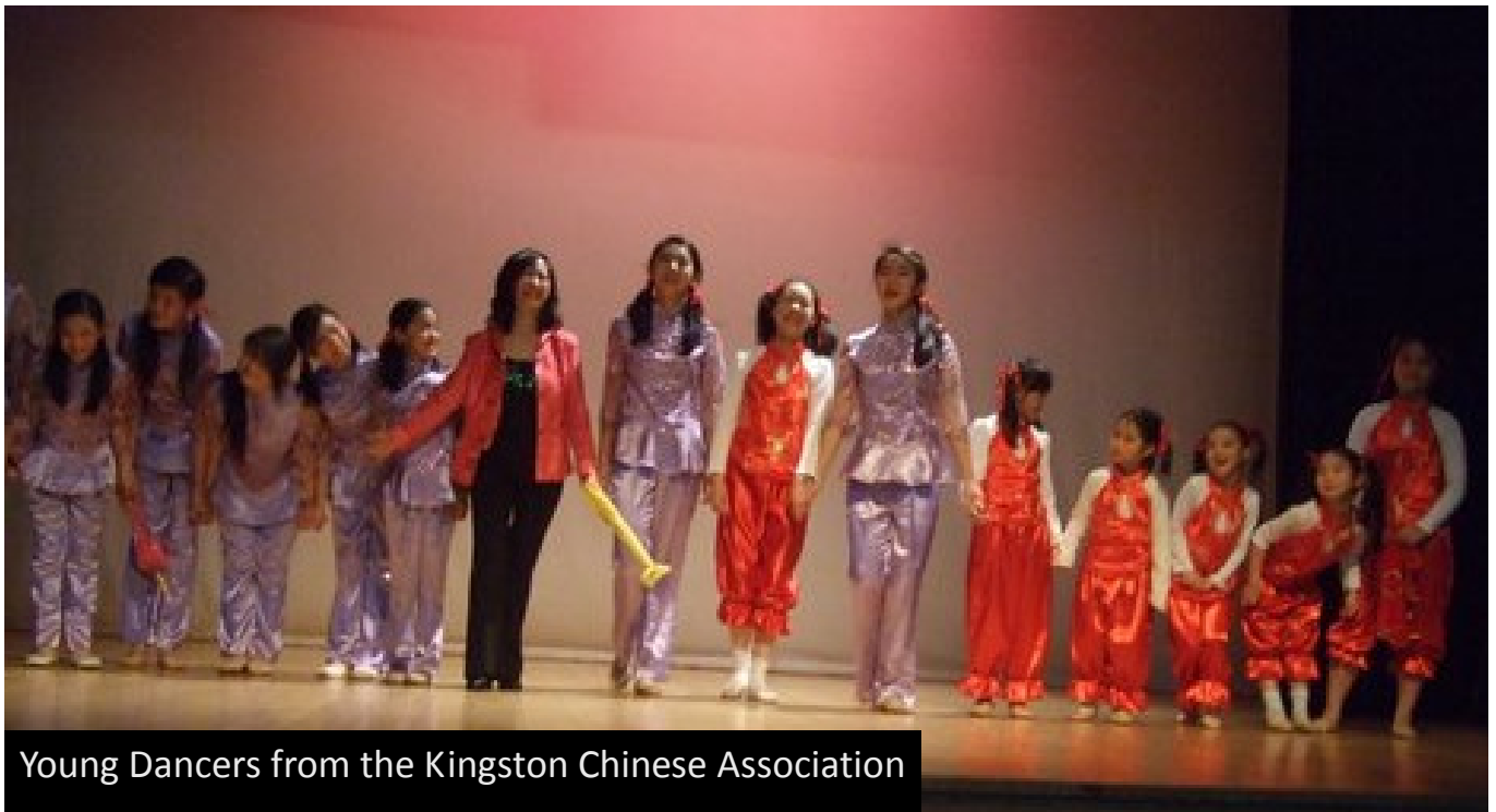
Young Dancers from the Kingston Chinese Association

The Gala is an opportunity for families of various faiths to come together to enjoy a variety of foods whilst being entertained by people, mainly young, of various cultures.