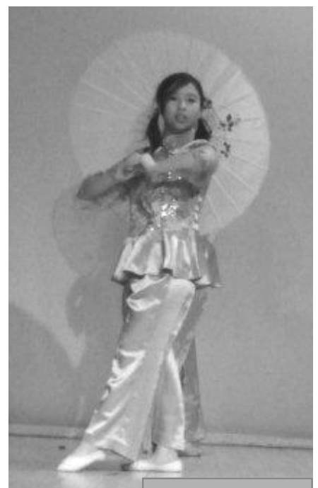
One of the young Chinese dancers

As for the Indian musicians and the graceful gyrating Indian dancers, one can only admire their artistic excellence and professionalism. This was an entertainment that would, in other situations, be too costly for an event run by a poor charity like ours. We were really privileged. Again the audience showed their appreciation.